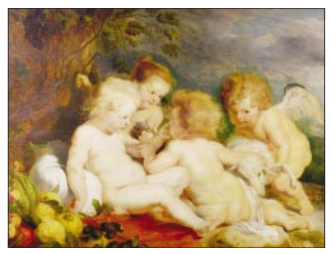
The group learning process: acquiring desirable learning skills

Students elect a chair for each PBL scenario and a "scribe" to record the discussion. The roles are rotated for each scenario. Suitable flip charts or a whiteboard should be used for