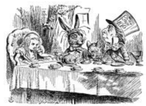
A dysfunctional group: a dominant character may make it difficult for other students to be heard